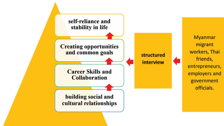
Figure 1: Conceptual framework (Adapt from Maslow, 1943; Khaenamkhaew, et al. , 2019)