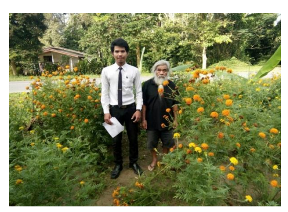
Figure4.To make drugs