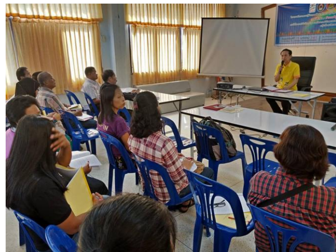
Fig.2. The conference uses three parts of cause and effect: people, wisdom, and resources, which will not create a conflict.