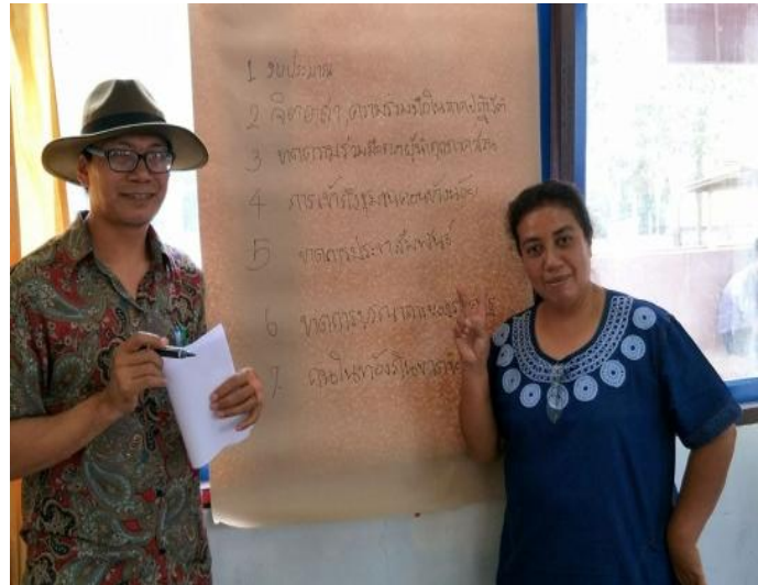
Figure 1. the researcher used qualitative studies through in-depth interviews, observations, and participatory action research.