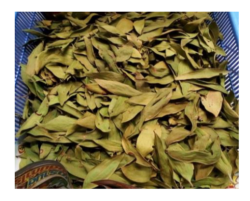
Figure 2. The leaves samples after drying at 60 °C for 4 hours