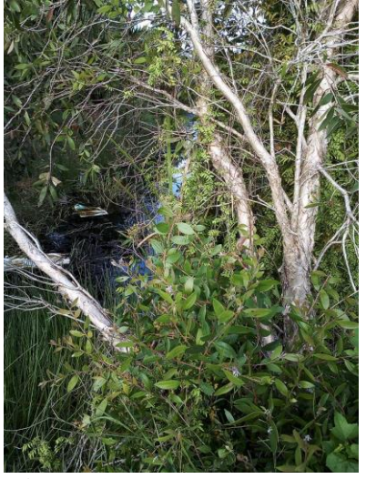
Figure 1. Melaleuca cajuputi

used as safe alternative botanical insecticide for controlling stored product insects.<sup>3,4</sup>